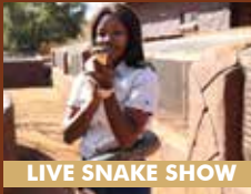
LIVE SNAKE SHOW