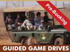
GUIDED GAME DRIVES