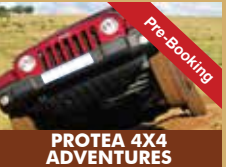
PROTEA 4X4 ADVENTURES