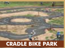
CRADLE BIKE PARK